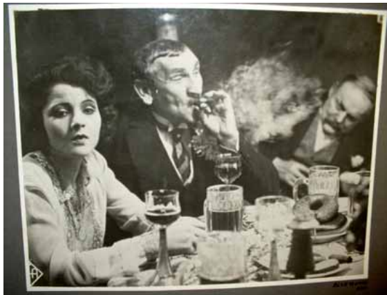
I Wish You Love