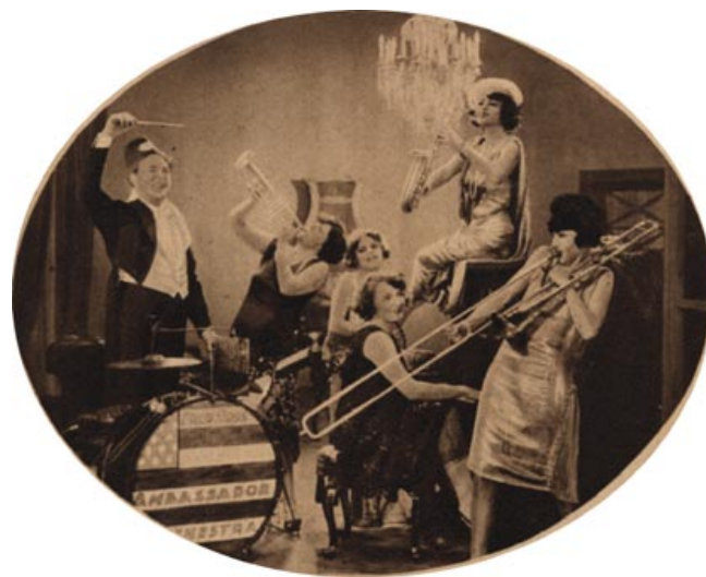
Is it Marlene playing the piano?

Apparently no film print has survived and the photos in Filmmuseum Berlin's photo archive don't show the jazz-band. However we've found a photo in an illustrated program which shows a girl at the piano who looks just like Marlene in these early stages of her career. Is this really her? We won't know until a better photo or a film print surfaces.