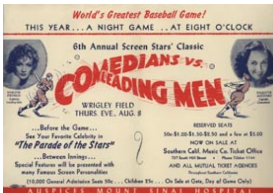
Comedians vs. Leading Men California, August 8 1940

Here is a small poster which happened to come to our collection