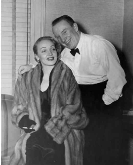
Marlene Dietrich and Richard Tauber at Carnegie Hall, New York 1946.