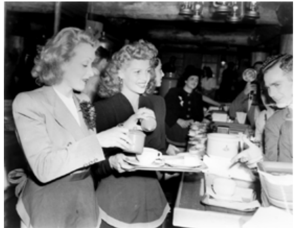
Marlene Dietrich and Rita Hayworth at Hollywood Canteen

And this photo we like very much because it shows Marlene's activity during WW II