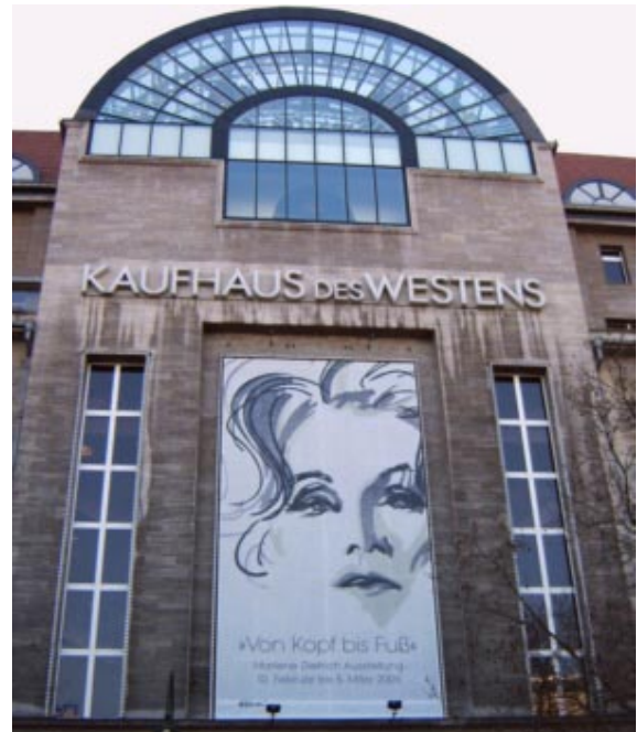
The exhibition poster at KaDeWe front

And then there are her shows and her songs. We mixed face, legs, love and songs and rising