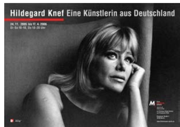
Exhibition Poster Same photograph is on the book cover