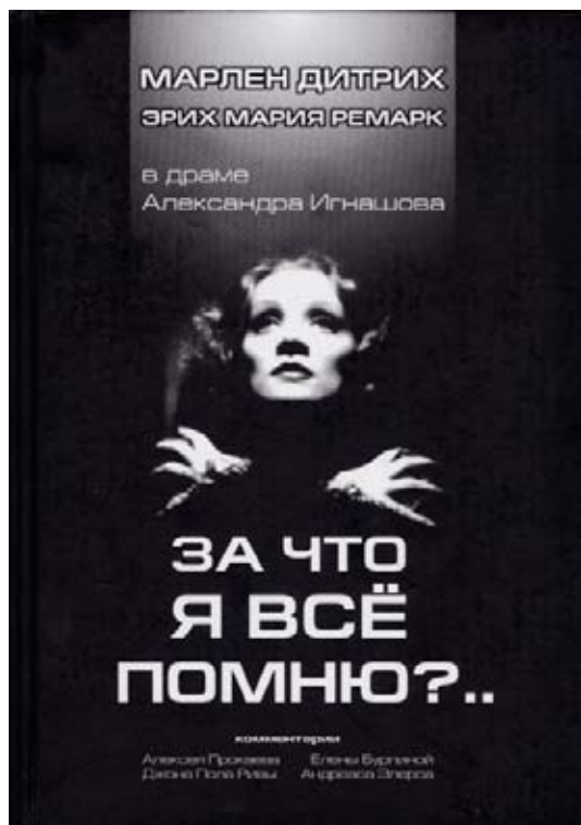
Za shto ya vsyo pomnyu?.. (Why do I have to remember?..) )

Sorry, we don't speak or understand Italian. It's a new book on Marlene – that we know. Anybody got any comments?