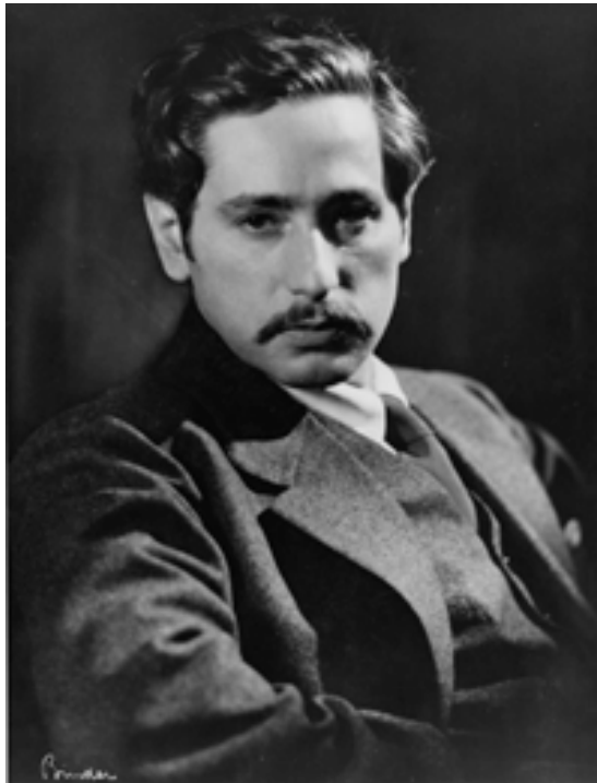
Portrait of the young Josef von Sternberg by Lotte Eckener done for Atelier Binder in 1929

In occasion of the centenary of photographer Lotte Eckener the Projektgruppe Fotografie am Bodensee shows „Lotte Eckener. Photographien von 1925 – 1965“ At Kulturzentrum am Münster in Konstanz, February 9 – March 26 2006; opening hours every day except Monday 10 – 6, on Saturdays and Sundays 10 – 5.