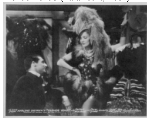
Lobby Card (11" X 14")

Description: This is from the only set of "blue" lobby cards known to exist from this title. Blue lobby sets were made for some of Paramount's major productions in 1931-1932 and only a few of these cards have shown up over the years.