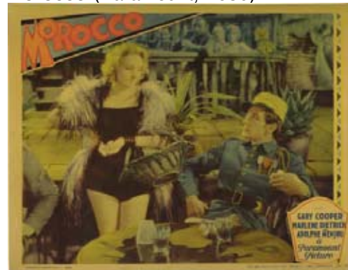
Lobby Card (11" X 14")

Description: This lobby card has some light toning, and a few small light wrinkles. There has been some restoration on the edges, but the image is in nice shape.