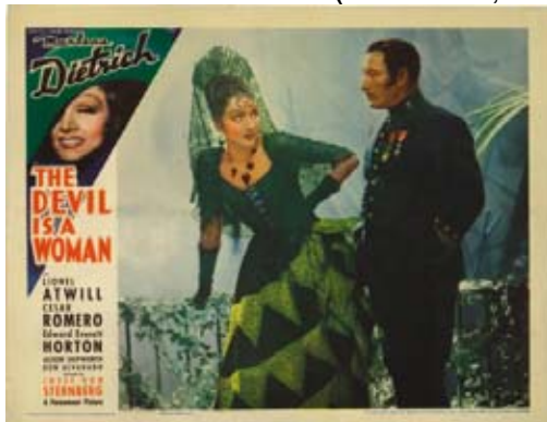
Lobby Card (11" X 14")

Description: This very clean scene card has illuminous color and clarity. If not for the small corner dings, some very minor wear in the blue field to the right of the title, and a tiny pinhole in the center of the top border, this card would be