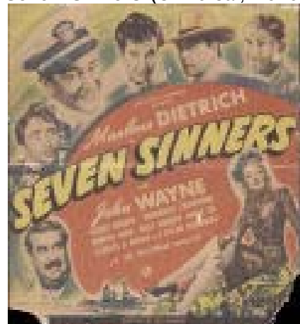
Window Card (13" X 14")

Description: This window card has been trimmed to approximately 13" X 14" and shows corner chips, edge chips, and crease wear. Some fading. Nice image of Dietrich. Condition: Fair/Good. Sold for $15 At: Internet Movie Poster Auction #56013, January 15 2006