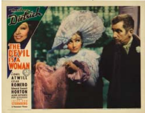
Lobby Card (11" X 14")

Description: The only imperfections that keep this card from being graded mint is the small British Censor stamp in the left margin and the slightest of corner dings.