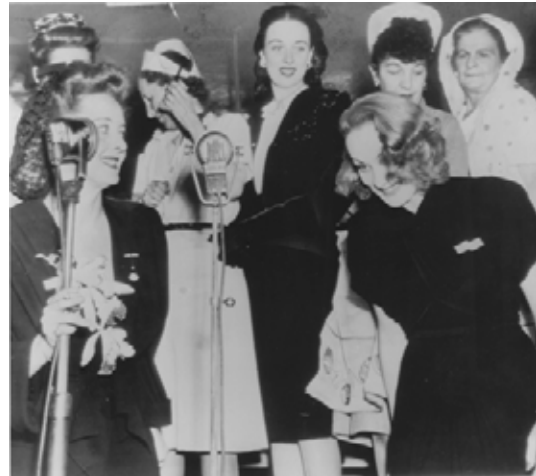
Bette and Marlene at the first anniversary party of the Hollywood Stage Door Canteen in 1943

Bette and Marlene – it seems to me that these ladies were swimming in different pools all of her lifetime. But there was a time when they were working together at the Hollywood Canteen where they both entertained American soldiers. The ladies respected each other. In December 1944 Bette writes to Marlene "in the field": "We so often think of you at the Canteen and look forward to the day when you will be back in this part of the world again. You are doing a wonderful job – I envy you – am hoping to get over myself this year – it seems to me the truly worthwhile experience presented to all of us in these times."