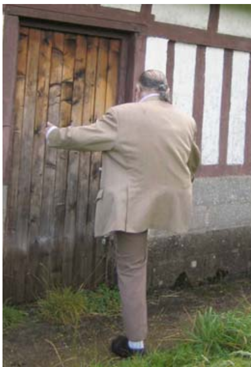
Troller pushing the door open to his archive