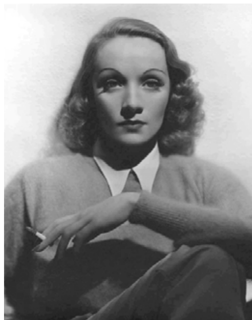
CatNr. 310: vintage print by George Hurrell

"Profiles in History" is offering in their new sale several vintage prints of Marlene by Richee and Hurrell. Highlight is CatNr. 310 with an estimate of $ 4,000 – 6,000.