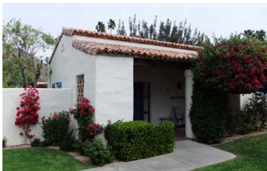
San Sebastian today