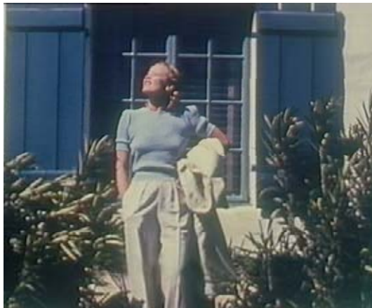
Marlene and Jean Gabin in La Quinta, CA, 1942 (taken from Home Movies)