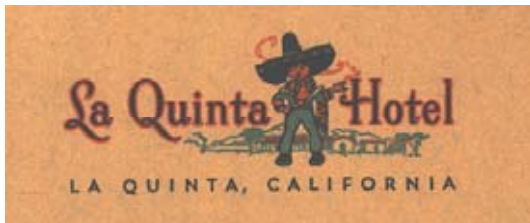
Letterhead of a letter sent from Marlene in 1942