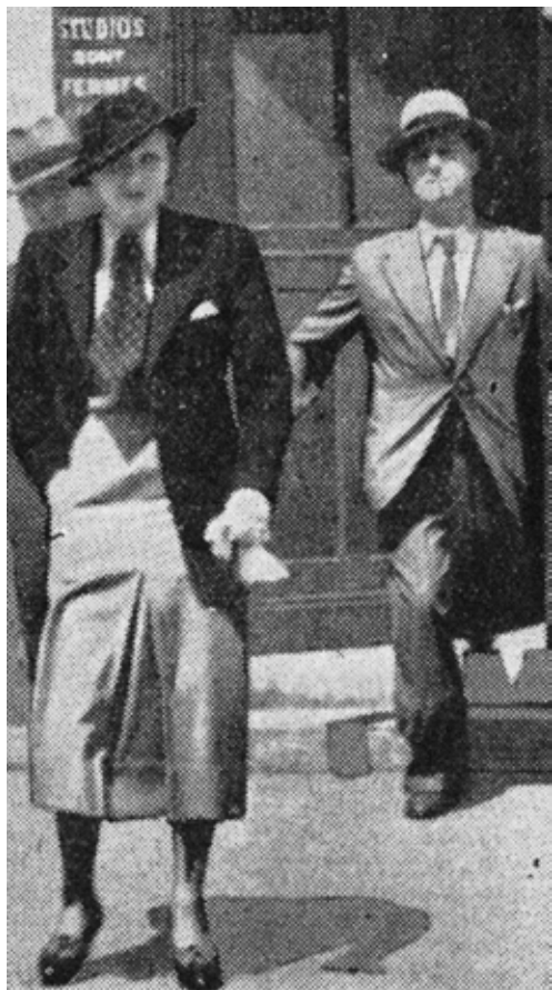
Marlene Dietrich leaving Les Studios

mais, par miracle, je peux rester: "C'est un musicien!" lui a jeté en réponse le chef d'orchestre, sans même prendre la peine de me regarder.