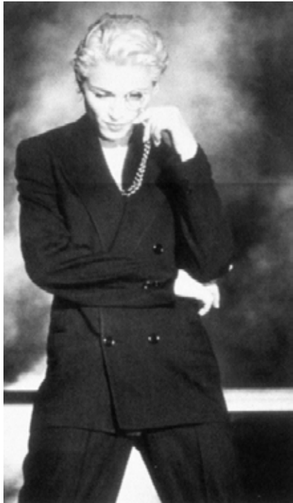
Madonna from the DIVA book