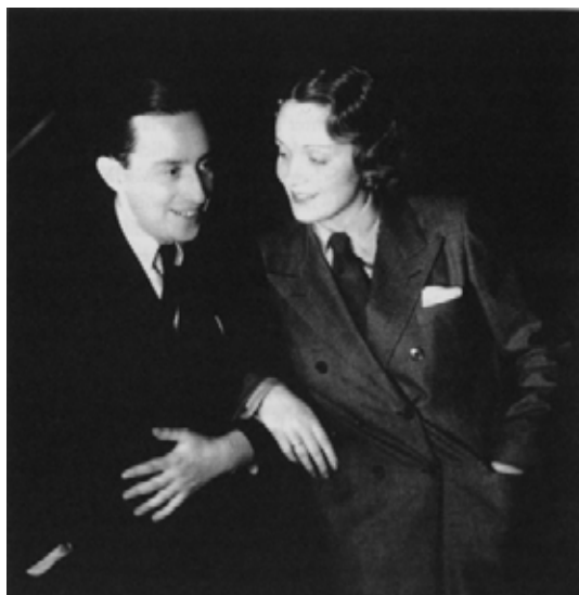
Curt Bois and Marlene Dietrich in Berlin 1931

The German actor Curt Bois worked with Marlene in German theatres. He was very reluctant and probably bored when you asked him about his memories of Marlene. In the book " Ich mache alles mit den Beinen ... Der Schauspieler Curt Bois ", Verlag Vorwerk 8, Berlin 2001, 201 pp. isn't much on their cooperation either except one photo – but isn't that gorgeous?