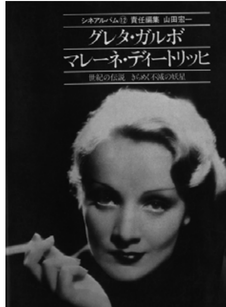
Koichi Yamada Greta Garbo/ Marlene Dietrich – Legends of the Century – Immortal Stars Tokyo: Hagar Shoten 1972