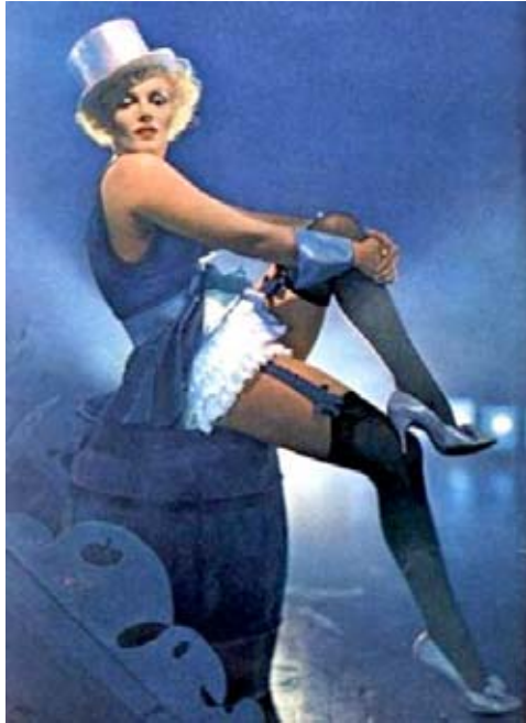
Marilyn Monroe featuring Marlene Dietrich in Life Magazine 1959

If you find more icons do send us a jpeg. We'll be happy to publish these photos.